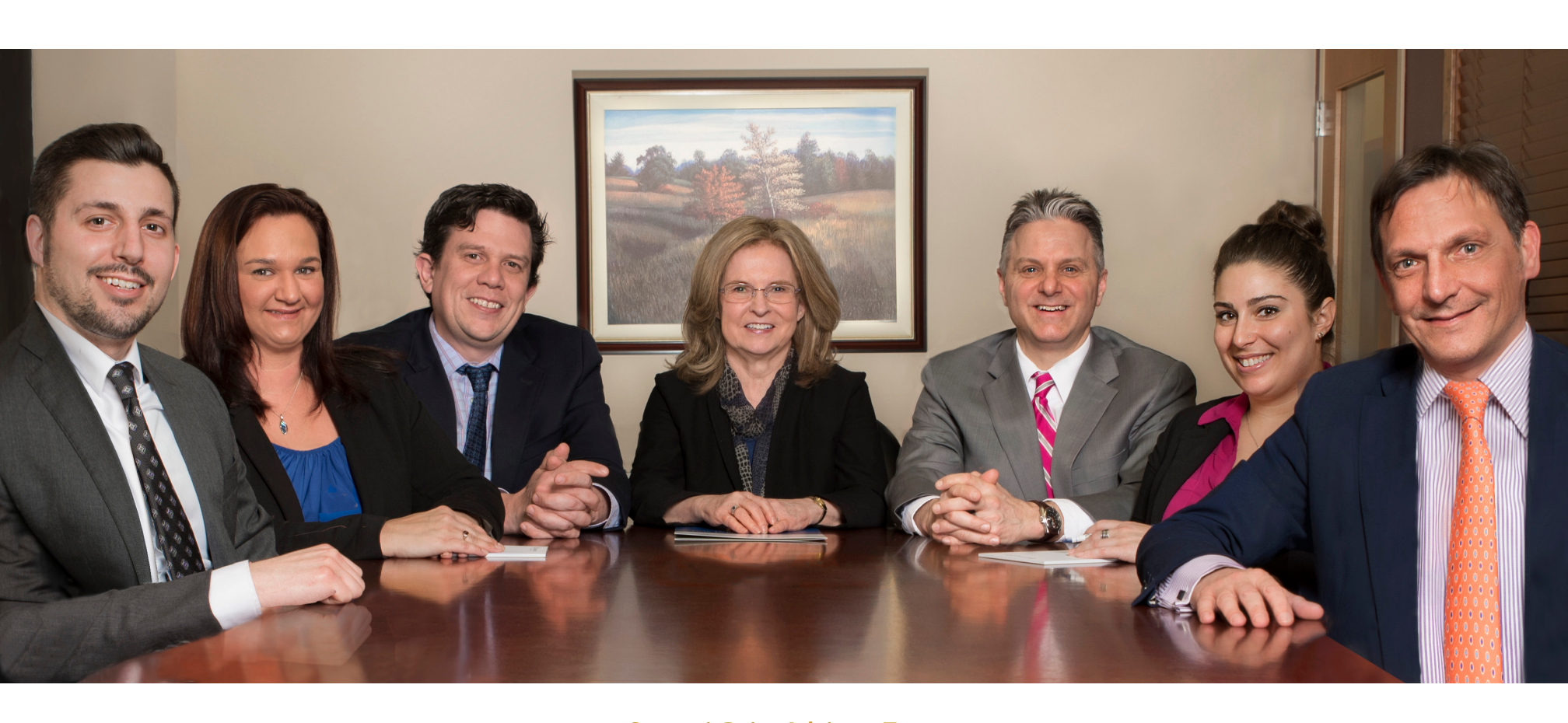
StrategicPoint Advisory Team